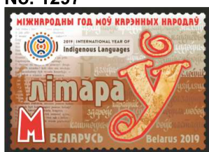
International Year of Indigenous Languages