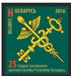
25th anniversary of the Customs of the Republic of Belarus