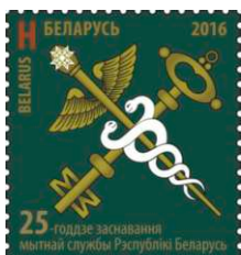
Elements of protection

Face value "H" is equal to the surface tariff of a letter up to 20 gram abroad.