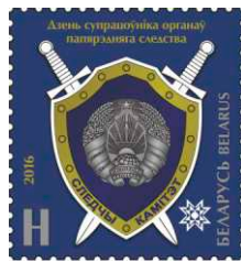
Elements of protection